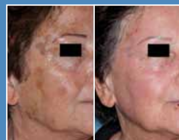
patient treated with Fraxel® Dual

Using this technology we can customize treatment so that there is very minimal downtime or maximal improvement in a single session. We usually combine several lasers in one session. This is necessary because of the precision of each laser. Trying to make one laser do all the work results in much more non-specific tissue damage because you then lose the precise targeting that is so valuable. That is the reason we have so many lasers in our practice, 38 to be exact, unlike any other practice in southern California!