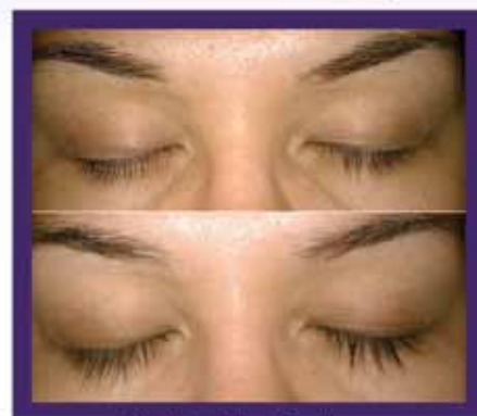
*Actual patient, Latisse for 3 months

Get those lusher lashes you've always wanted and glowy skin!