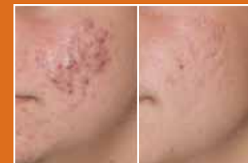
patient was treated with PDT

We are also excited to offer Isolaz® treatments, which use suction combined with a light device, to both clean the pores that become blocked in acne, while delivering gentle heat to the skin. The treatment takes 10 minutes, and leaves the skin feeling clean, tight and refreshed. Photodynamic therapy (PDT) is a very effective procedure that uses a photosensitizing drug to apply light therapy selectively to target the oil glands responsible for causing acne. Treatment shrinks the oil gland, therefore decreasing oil production and thereby acne. In our practice we use a combination of two different laser devices, and 2 light sources to perform the procedure, which also aids in evening out skin tone and improving skin texture typically after just one treatment. If scarring has already occurred from previous acne, there is hope. Lasers are able to penetrate deeper in the skin, where scarring occurs, to stimulate new collagen production and improve the overall texture and appearance of acne scars. Fillers can also be used to fill certain types of acne scars, making them practically imperceptible. We can even use a culture of your own skin cells to replace collagen loss from acne scarring. Feel free to schedule a free consultation for more information.