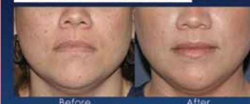
Before After *Actual Patient

Save on Restylane! Bring in this ad & save $50 off per syringe!